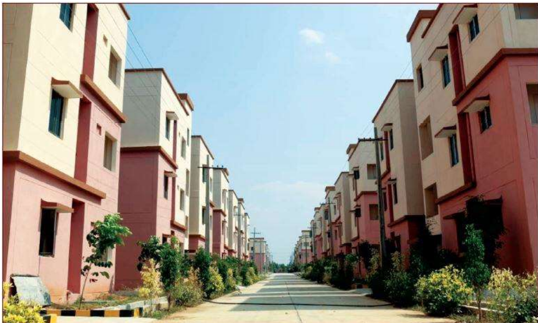
EWS housing under PMAY- HUDCO Project

...the unfolding story in developing countries including India is messy and hidden wherein a new class of urban settlements, increasing informality and rise of urban gig economy, service – led urbanization, urban prosperity and livability below potential are the characteristics. There is a need to understand the processes of natural growth, urban rural migration, rural areas turning urban-the costs involved and the benefits thereof. The consequences of the transformation such as income growth, poverty reduction, large inequalities and a widening chasm, climate change induced disasters and vulnerability of settlements are visible. The global response and the need for change have given rise to the New Urban Agenda and Sustainable Development Goals.