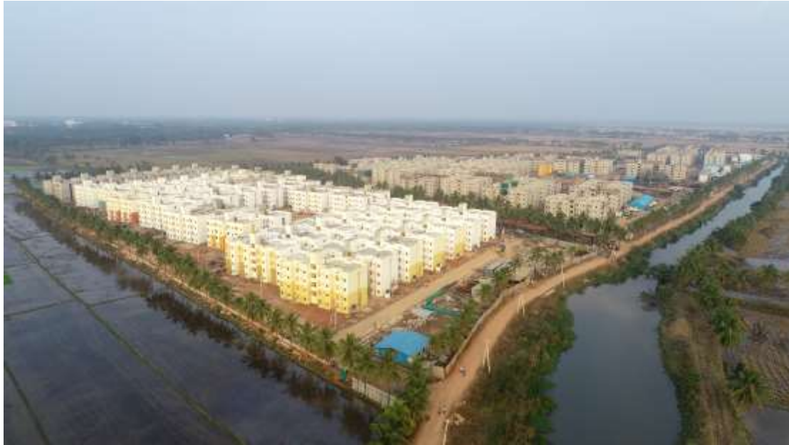
Affordable Housing Complex at Bhimavaram- HUDCO Project