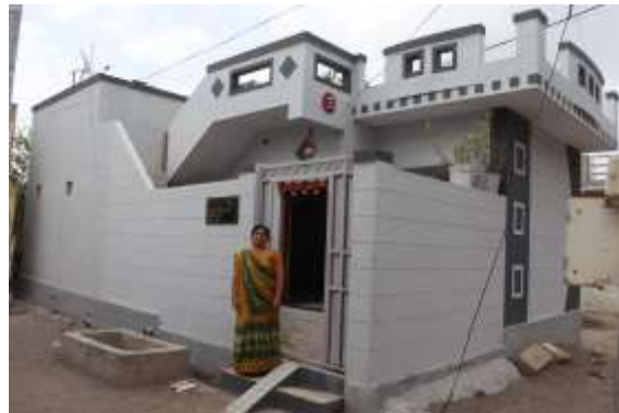
Housing under BLC- PMAY Gujarat