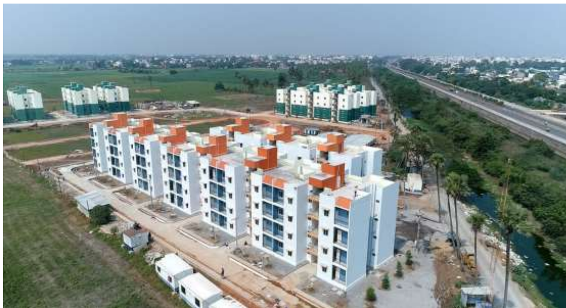
Affordable Housing under PMAY at Tenali- HUDCO Project

The mobility options and access to basic services is essential for the efficient functioning of our cities and towns, as they expand. The issues of multimodal transport options, urban livelihoods and financial inclusion through micro-finance have been addressed and discussed. The use of Information and communication technology for connectivity and security in human settlements is crucial for the growth of digital India. Effective formal solutions are crucial for the success of urban development particularly in metropolitan areas. The role of government is of a facilitator for improving the affordability of various alternatives of structurally safe housing typologies, adhering to planning norms and establishing linkages with the city infrastructure services. There is a need to develop processes and tools to protect the social, economic and cultural fabric of the people who have been living in informal settlements. The course on “Formal Solutions to Informal Settlements” looks into these challenges of informal settlement and the various interventions including innovative solutions to deal with such issues being faced by most of the cities of the developing world.