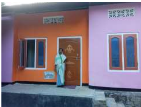
Housing under BLC-PMAY- Assam

Structured visits to in-situ improvement, resettlement and rehabilitation projects, livelihood and technological options relevant to the programme will be organized to impart practical experience to the participants. The visits to projects implemented by Central and State Governments, major public and private sector undertakings, NGOs and CBOs will also be undertaken.